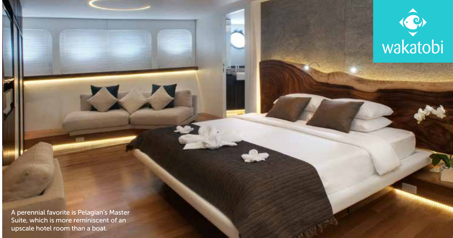
A perennial favorite is Pelagian's Master Suite, which is more reminiscent of an upscale hotel room than a boat.

Pelagian's itineraries begin and end at Wakatobi Resort, presenting a prime opportunity to add a stay at the resort before or following your cruise. Please consult with your guest experience representative.