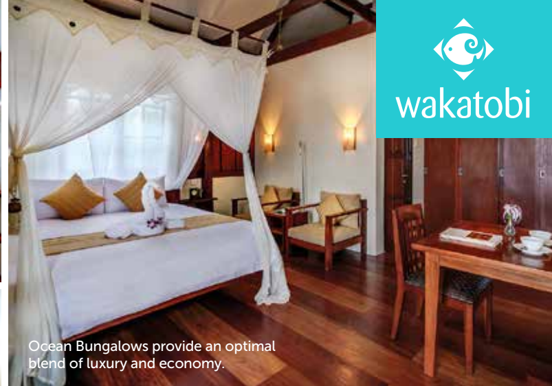
Ocean Bungalows provide an optimal blend of luxury and economy.