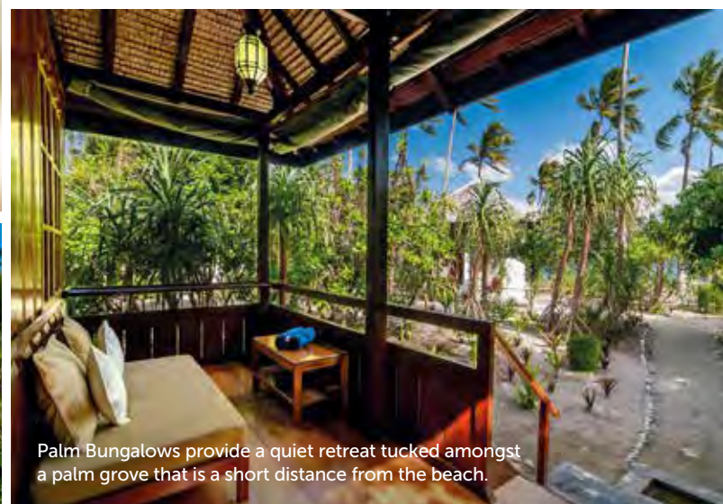
Palm Bungalows provide a quiet retreat tucked amongst a palm grove that is a short distance from the beach.