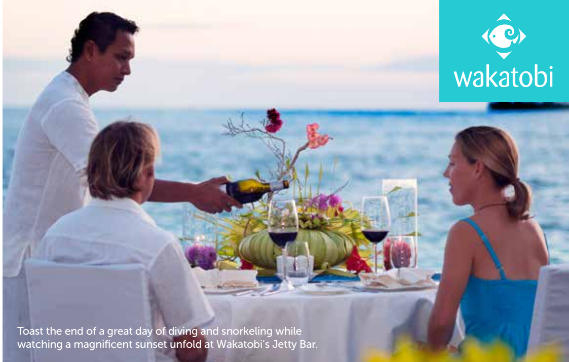
Toast the end of a great day of diving and snorkeling while watching a magnificent sunset unfold at Wakatobi's Jetty Bar.